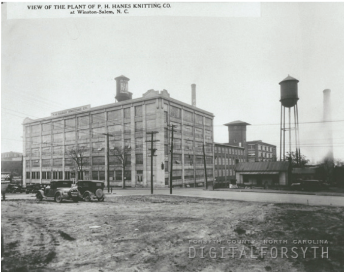
P. H. Hanes Knitting Company plants on North Main Street, at Sixth Street, c. 1920