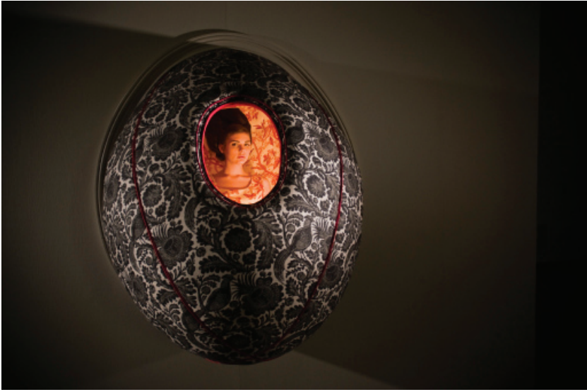
Momentos of a Doomed Construct, 2009

Upholstery, Plywood, Foam, Fabric, Embroidery, Live models