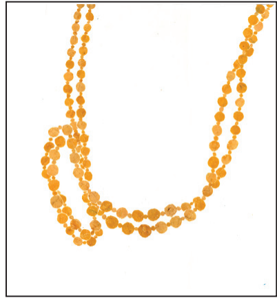
Pearls III , 2010 Tobacco Leaf on Paper