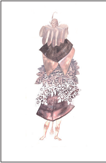
Column from The Lost Colony Project, 2009-2010 Gouache on Paper