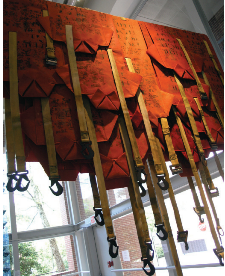
The Coercion, 2011 Non-woven Fabric, Metal Hooks, Rings