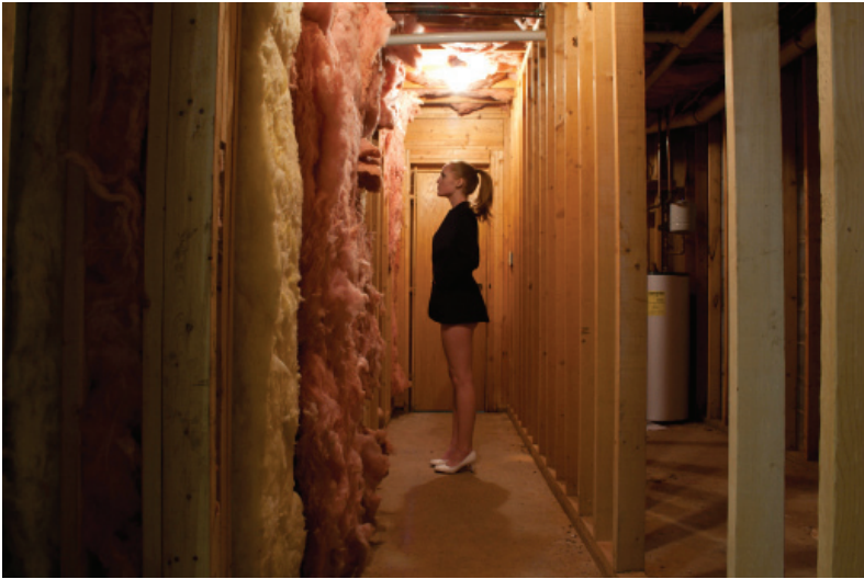
Death of Fashion: Ascension of the Mannequin [series], 2010-2011