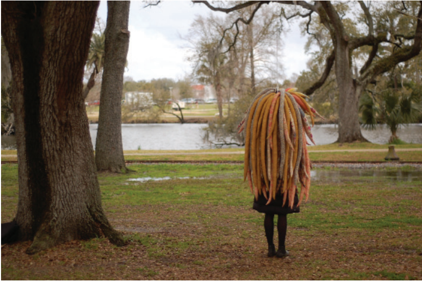
Locks and Manes, 2010 Mixed Media