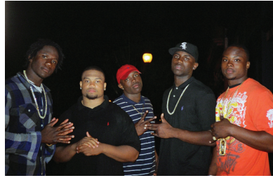
2:30 Portraits, 2010 Photographs, Video, Audio Recordings