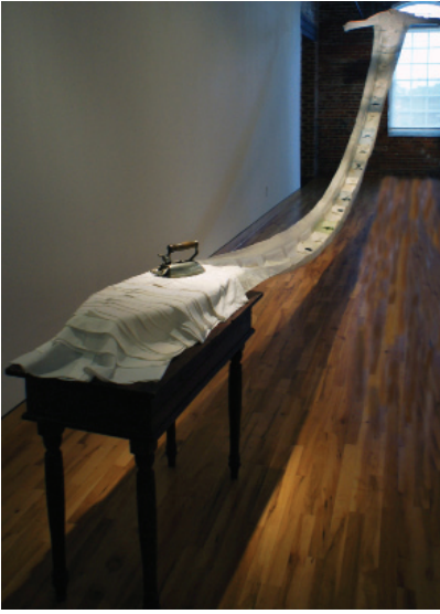
Didn't Iron for Me Anymore, 2010 Men's Shirts, Printed Silk, Wood Table, Iron